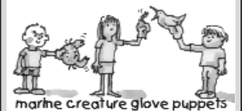
marine creature glove puppets

Adding fun to Environmental Education - back page