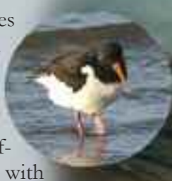
Aerial view of Pilsley Island Top: Bird hide recently renovated by the Friends Left: oystercatcher

The habitats on the island include sand dunes with Marram grass, Sea Bindweed and Sea Holly, vegetated shingle supporting species such as Sea Kale, Sea Sandwort and Rock Samphire. These habitats are very fragile and even limited trampling can have long-term effects. Various types of saltmarsh occur with