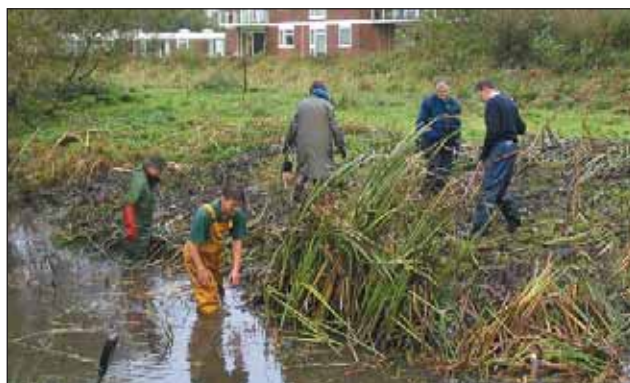
Clearing the millstream at Fishbourne and litter picking at Snowhill are two of the tasks completed this year