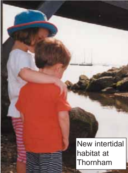
New intertidal habitat at Thornham

I have no doubt that we will have to adapt to sea level rise - to defend where we have to, and to realign where we can. This will ensure that the harbour we have tomorrow, although a slightly different shape, will be as valuable for wildlife, as attractive for visitors, and as safe for residents, while remaining a thriving leisure harbour.